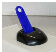
Touch & Hold Socket Oval and Square

The manufacturer reserves the right to change specifications without prior notice