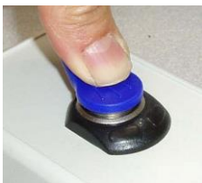
Touch Socket TSL & TSM