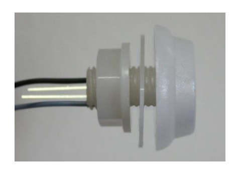
Touch Socket Illuminating